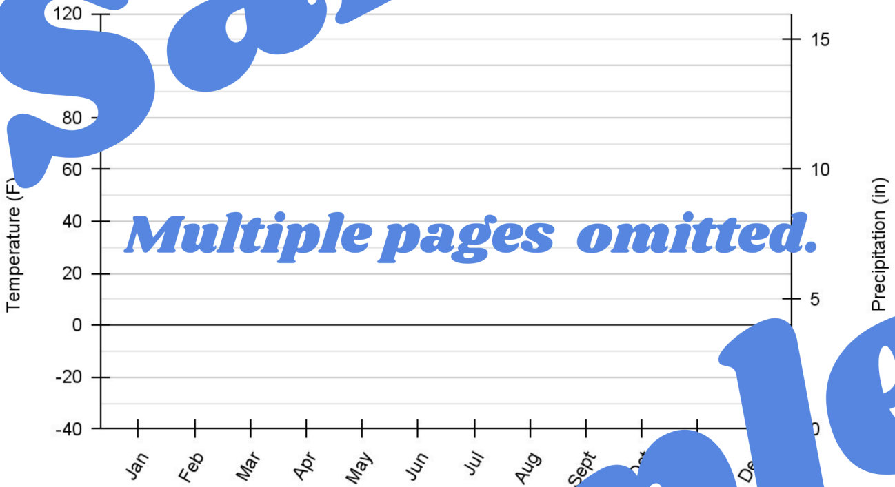
Average Temperature & Precipitation Temperature Precipitation

Use the Koppen Climate Type definitions to name and describe the climate of your island: